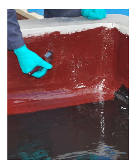
Belzona 4361 is available in black and red to facilitate application and to prevent misses.

For more information, please contact your local Belzona representative: