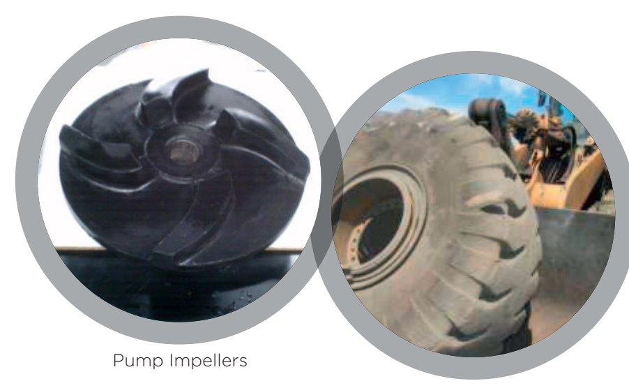
Off Road Tyre Sidewalls