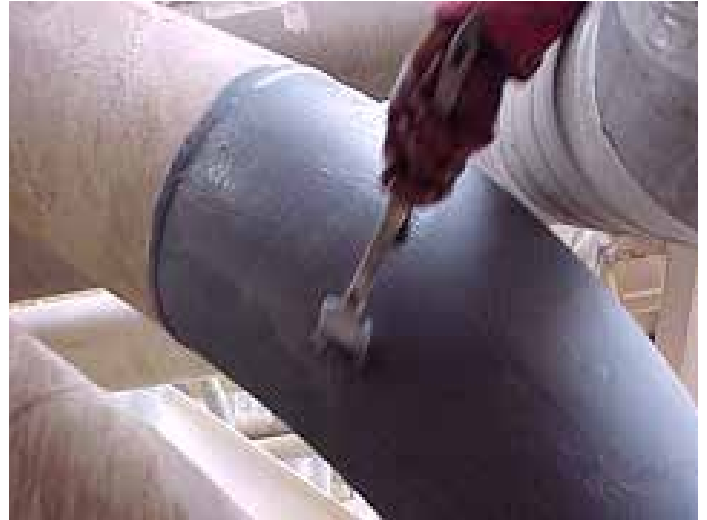
Belzona 5851 used for pipe corrosion protection

Specialist tools are not required to apply Belzona 5841. It is also tolerant to surface preparation.