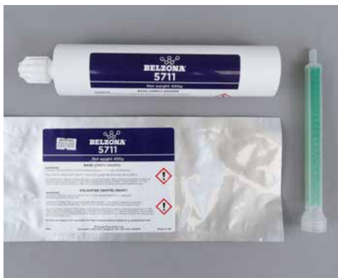
Belzona 5711 supplied in cartridge with static mixer.