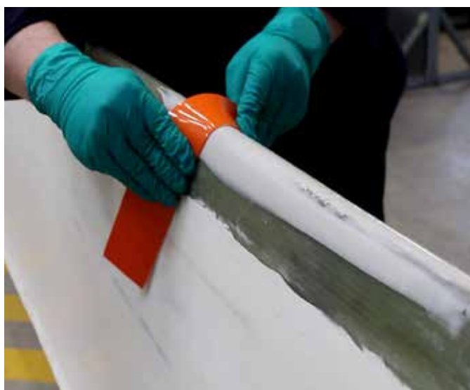
Easy to contour leading edge, no need for sanding.

For more information, please contact your local Belzona representative: