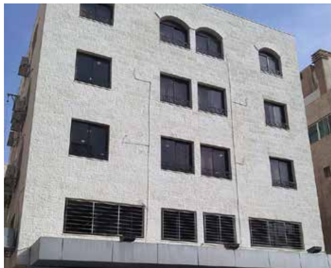
Invisible protection applied to hotel façade

Belzona 5122 helps to reduce dirt retention as well as deter the growth of mildew, moss and lichen.