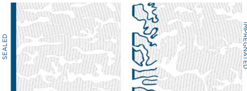
The Difference Between Impregnation and Sealing.

Instead of sealing the substrate, Belzona 5122 impregnates the brickwork, masonry or concrete, combining excellent waterproof protection with the benefit of breathability.