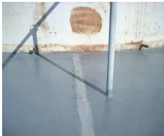
Used to refurbish failed joints in containment area

Manually applied without the need for hot work or specialist tools, reducing downtime.