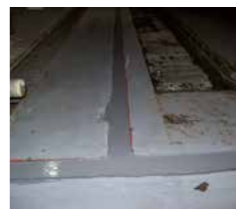
Repaired with Belzona 4521

For more information, please contact your local Belzona representative: